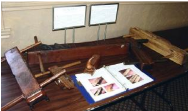
Informative display on Rare Spelk Planes