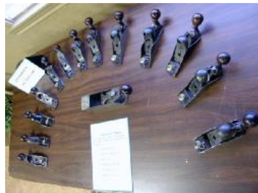
An outstanding collection of rare handled block planes