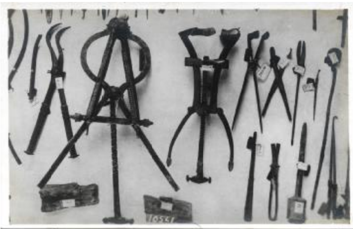
Surgical Instruments from the ruins of Pompeii (79 AD)