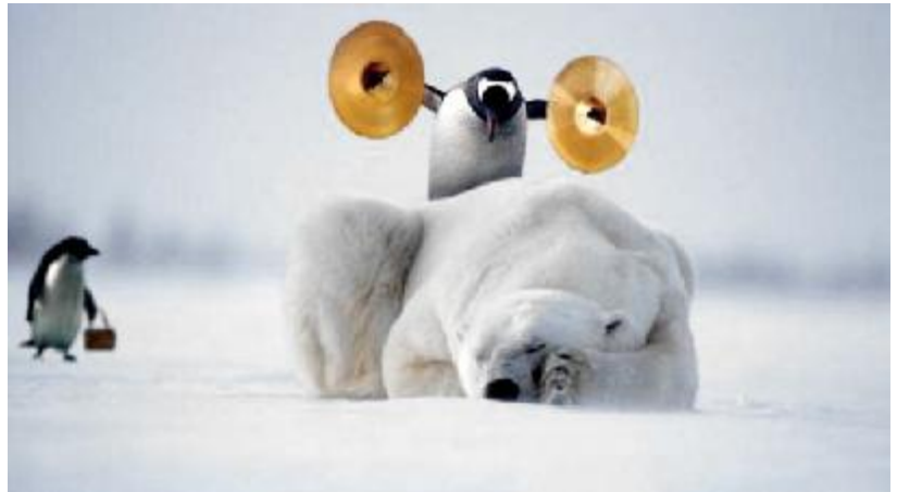
“at the sound of the tone”