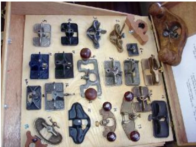
Collection of Tiny Routers