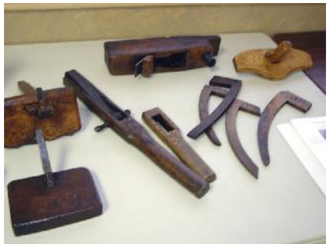
18 th & Early 19 th c. Cooper's Tools